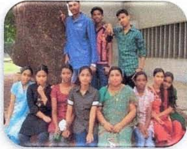
The students who went to Mumbai

All the children were given 'payasam', a special sweet dish, and the teachers were given token gifts and a good lunch. The teachers had 'Onappattu' (songs) competition in groups followed by organized games which were enjoyed by all. On a Sunday the parish too had Onam celebration with different competitions followed by lunch.